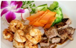
Hibachi Steak and Shrimp