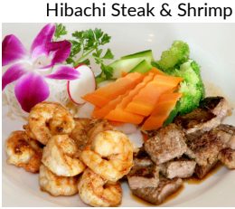
Hibachi Steak & Shrimp

Served with 2pcs of Hibachi shrimp appetizers, Japanese onion soup, garden salad with house dressing, vegetables, and steamed rice or fried rice. Fried rice prepared at Hibachi table is $3.29 extra