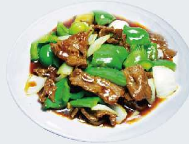
Pepper Steak with Onion