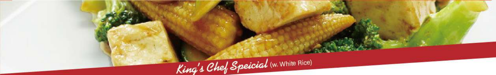
King's Chef Special (w. White Rice)