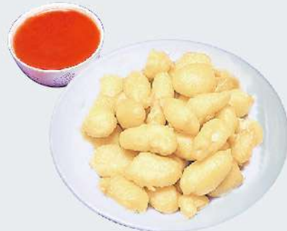
Sweet & Sour Chicken