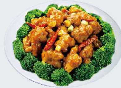
🔪 General Tso's Chicken