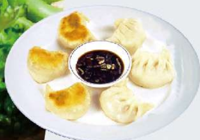
Steamed or Fried Dumpling