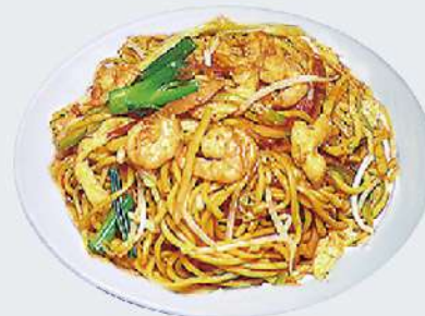
Shrimp Lo Mein